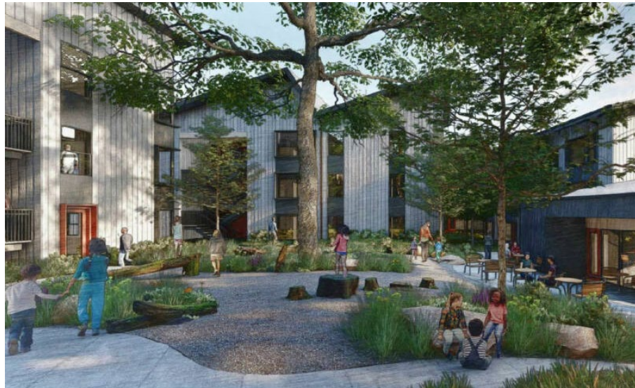
Rendering of Verano Family Housing, an approved affordable housing development.

The County has identified 1,253 units in 14 projects that have already been planned, approved, or proposed but are not yet completed. Of these, three projects are 100 percent affordable, 10 projects have some affordable units, and four projects have solely market-rate units.