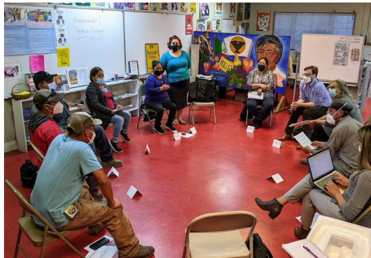
Focus Group at Graton Day Labor Center

Through this outreach, the community identified housing affordability and availability as the greatest needs. Other recurring themes include concerns about natural disasters, accessibility, lack of infrastructure, construction costs, permitting fees, second homes or vacation rentals, and awareness of tenants' rights. This input was integrated throughout the analysis of housing needs, constraints, and considered when developing the Housing Strategy and the Housing Action Plan. The Housing Element Appendices contain more information on public participation efforts during the Housing Element update.