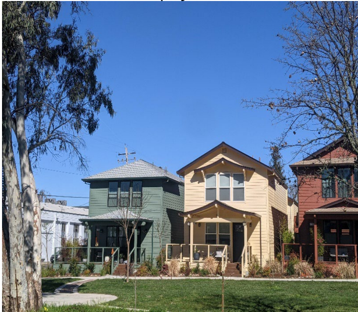
Two Habitat for Humanity homes in Green Valley Village, 2019