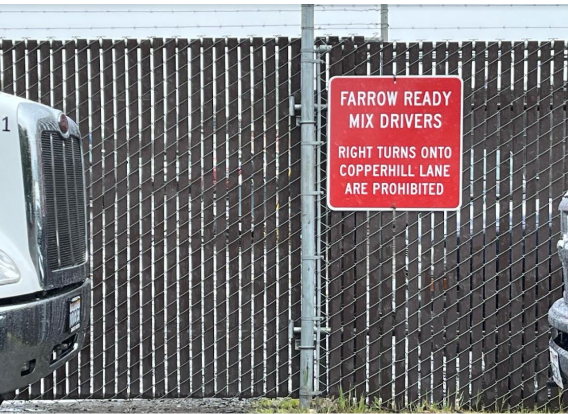
This sign is posted at Copperhill Lane and Brickway Boulevard on the Cream's fence.