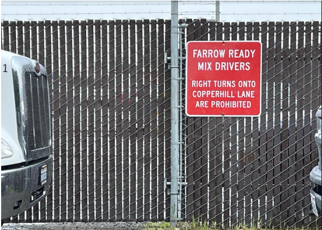
This sign is posted at Copperhill Lane and Brickway Boulevard on the Cream's fence.