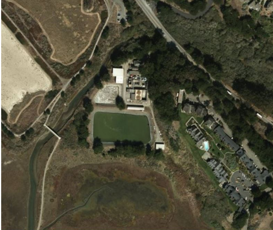
Bodega Bay PUD Wastewater Treatment Plant