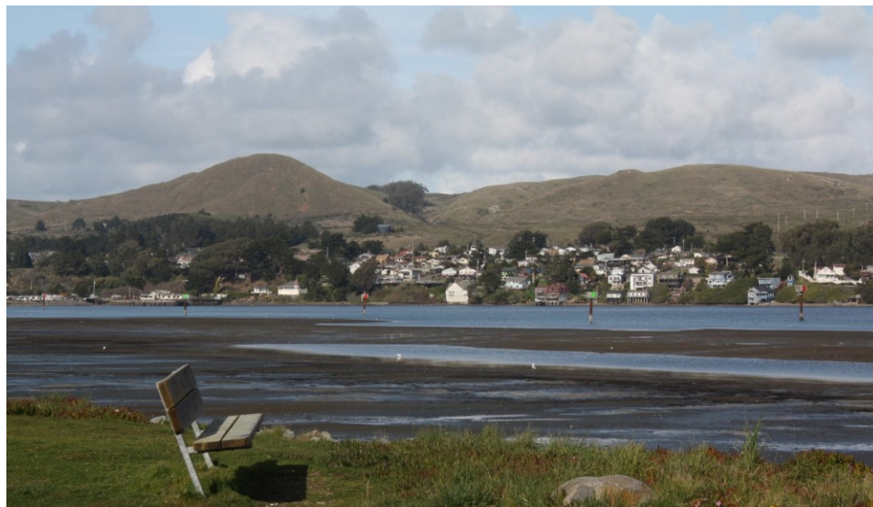
Westside Regional Park