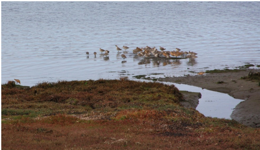
Coastal Brackish Marsh

Data on the location and size of coastal wetlands is from the San Francisco Estuary Institute and Aquatic Science Center, part of the California Aquatic Resource Inventory (CARI; Inventory). The Inventory is a compilation of wetlands, streams, and riparian areas in California. This statewide dataset pulls together many sources of wetland data. In the case of Sonoma County, the National Wetlands Inventory, originally from the U.S. Fish and Wildlife Service, is the source of the wetland data. The National Wetlands Inventory was last updated in 2010 and was acquired by the San Francisco Estuary Institute in 2011. Table 3 identifies the California Aquatic Resource Inventory wetland classifications comprising the Coastal Freshwater Marsh, Coastal Brackish Marsh, and Bodega Harbor Tidal Mudflat wetland categories.