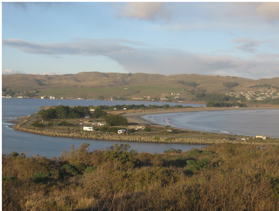
Doran Beach Regional Park – Jetty Campground

Doran Beach Regional Park. In 2030 7% of the area would be permanently inundated by sea level rise and 17% would be subject to periodic flooding during storm events. In 2100 under the best case scenario, 19% of the area would be permanently inundated and 35% would be subject to periodic flooding during storm events. Under the worst case scenario, 36% of the area would be permanently inundated and 75% would be subject to periodic flooding. Permanent inundation of the park would result in loss of the following recreational amenities: (1) entire Doran Beach, (2) Jetty Day Use Area, (3) Miwok Tent Campground, and (4) Boat Launch & Parking.