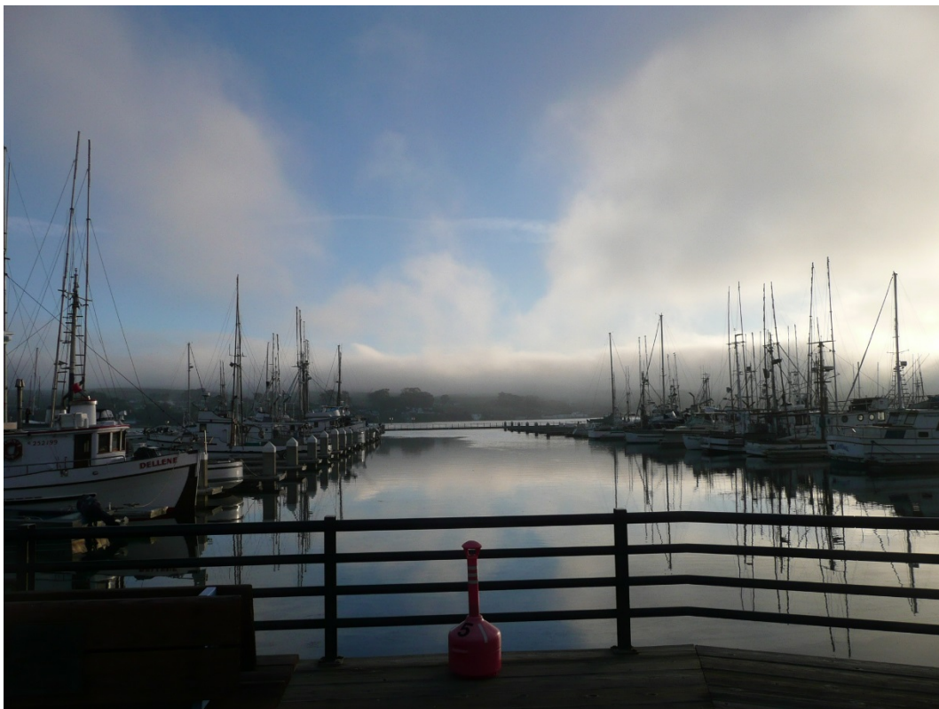
Spud Point Marina

Annual festivals demonstrate the economic and cultural significance of fishing to the Bodega Bay community: the Fisherman's Festival and Blessing of the Fleet for the approaching salmon season in April and The Seafood, Art, Music, and Wine Festival in August.