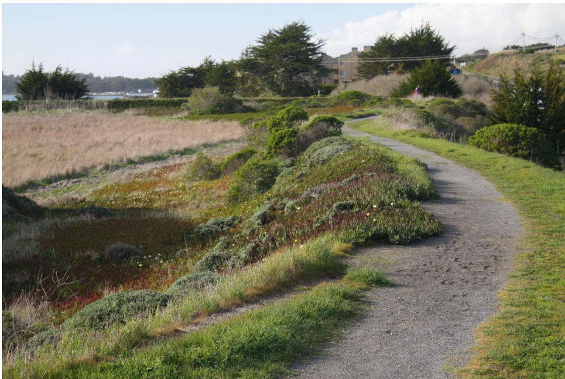
Birdwalk Loop Trail

The Dredge Spoil Disposal Ponds Site is projected to be at risk of permanent inundation from sea level rise by 2100. In 2030 less than 1% of the site would be permanently inundated by sea level rise and 2% would be subject to periodic flooding during storm events. In 2100 under the best case scenario, 2% of the area would be permanently inundated and 3% would be subject to periodic flooding during storm events. Under the worst case scenario, 2% of the area would be permanently inundated and 5% would be subject to periodic flooding.