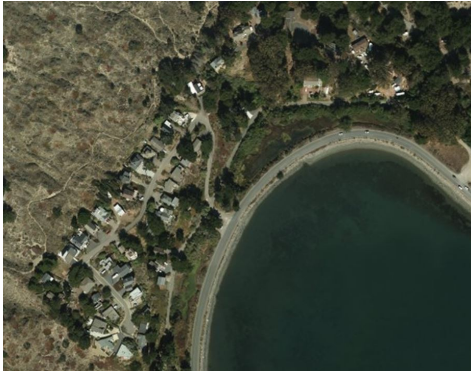
UR-2 and RR-1