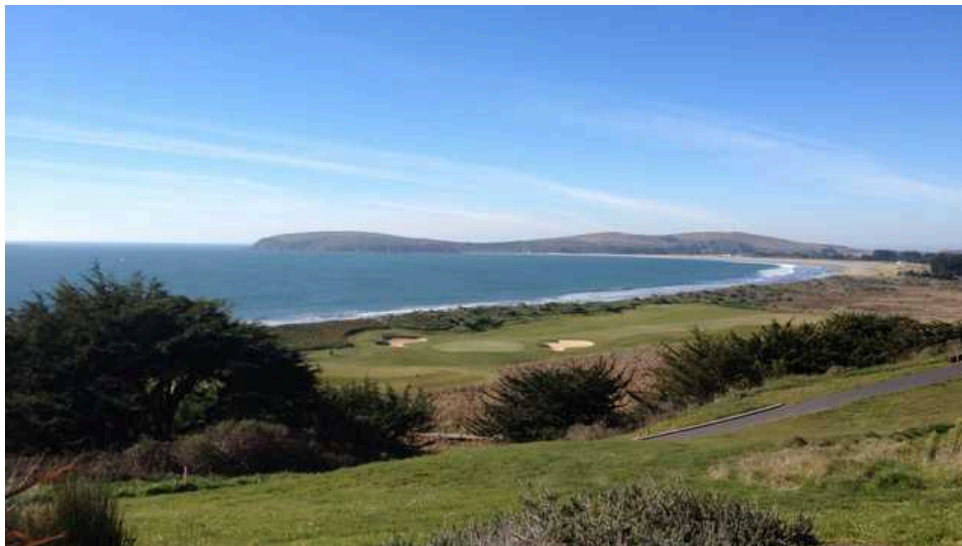
Links at Bodega Harbour Golf Course

In 2030 the grounds would not be permanently inundated by sea level rise, and 6% of the grounds would be subject to periodic flooding during storm events. In 2100 under the best case scenario 9% of the grounds would be permanently inundated and 21% would be subject to periodic flooding during storm events. Under the worst case scenario, 23% of the grounds would be permanently inundated and 40% would be subject to periodic flooding.