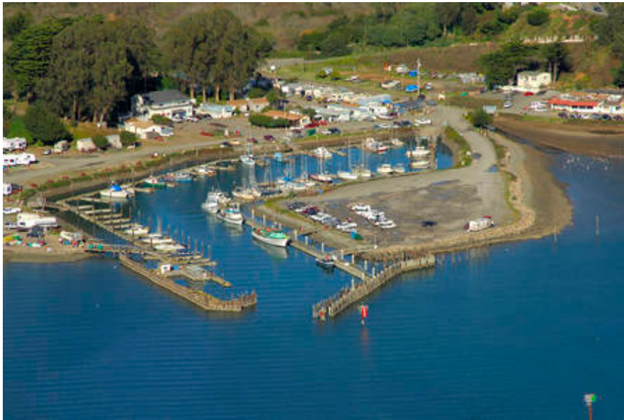
Porto Bodega Marina & RV Park

Permanent inundation of all or a portion of marinas would result in the loss of marine industrial land area to bay waters.