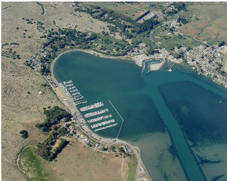
Bodega Harbor Area

Assets in the Bodega Harbor Area vulnerable to sea level rise and storm events include Westshore, Eastshore, and Bay Flat Roads; public and private marinas; residential development; and coastal freshwater marsh and tidal mudflat. Sea level rise will impact these valuable assets leading to potential impacts on access; land use; habitats, including critical habitat; recreation and tourism; and commercial fishing. The floating docks at some of the marinas are resilient to rising tides; however, the residential development and the low-cost visitor-serving facilities at marinas are not as adaptable. Some residential buildings may not have direct impacts from sea level rise due to their elevation, but could become isolated and cut-off from all services due to compromised access and damaged utilities.