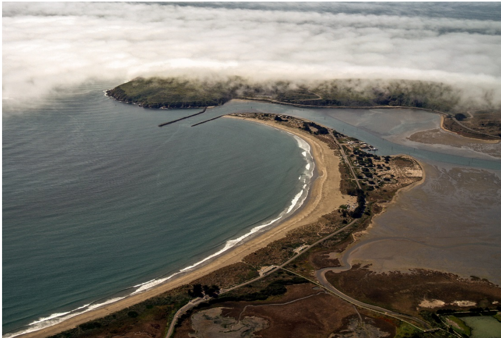
Doran Beach Regional Park

Doran Beach Regional Park. Doran Beach Regional Park has a wide, 2-mile stretch of beach on Bodega Bay and is ideal for walking, picnicking, playing in the sand, flying kites, surfing, and bird-watching. Over 120 tent and RV campsites are available. A boat launch provides access to Bodega Harbor for sport fishing, kayaking, stand-up paddling, and kite surfing. A jetty at the harbor mouth is a popular spot for rock fishing and exploring sea life.