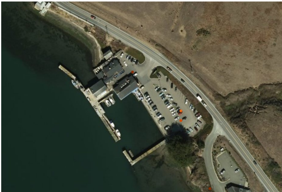
Lucas Wharf Restaurant & Bar

COM-1. In 2030 5% of the area would be permanently inundated by sea level rise and 9% would be subject to periodic flooding during storm events. In 2100 under the best case scenario, 10% of the area would be permanently inundated and 14% would be subject to periodic flooding during storm events. Under the worst case scenario, 9% of the area would be permanently inundated and 19% would be subject to periodic flooding.