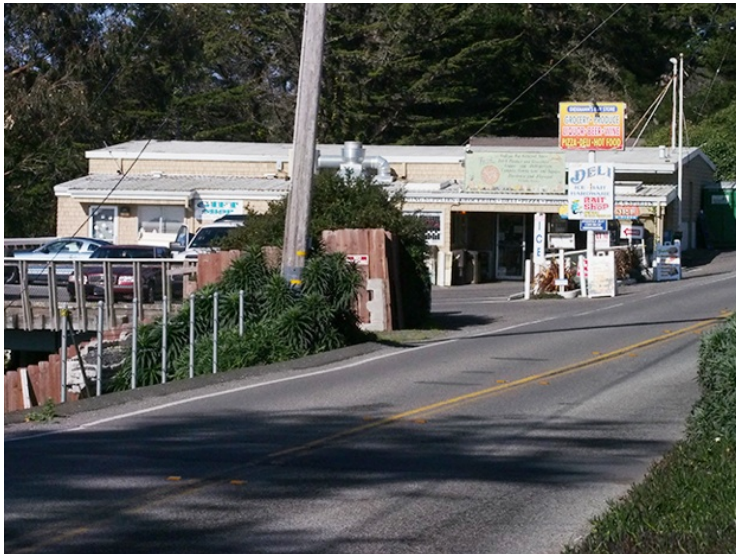
Diekmann's Bay Store

COM-4. In 2030 5% of the area would be permanently inundated by sea level rise and 16% would be subject to periodic flooding during storm events. In 2100 under the best case scenario, 18% of the area would be permanently inundated and 27% would be subject to periodic flooding during storm events. Under the worst case scenario, 34% of the area would be permanently inundated and 56% would be subject to periodic flooding.