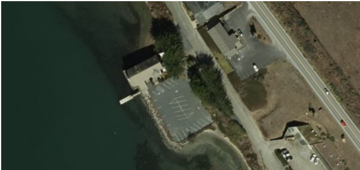
Bodega Harbour Yacht Club

The Bodega Harbour Yacht Club is projected to be at risk of permanent inundation from sea level rise by 2100. In 2030 8% of the site would be permanently inundated by sea level rise and 34% would be subject to periodic flooding during storm events. In 2100 under the best case scenario, 13% of the site would be permanently inundated and 49% would be subject to periodic flooding during storm events. Under the worst case scenario, 48% of the site would be permanently inundated and 60% would be subject to periodic flooding.