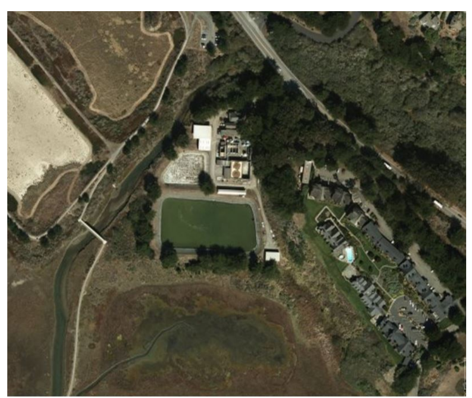
Bodega Bay PUD Wastewater Treatment Plant