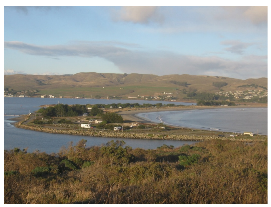
Doran Beach Regional Park - Jetty Campground

Doran Beach Regional Park. In 2030 7% of the area would be permanently inundated by sea level rise and 17% would be subject to periodic flooding during storm events. In 2100 under the best case scenario, 19% of the area would be permanently inundated and 35% would be subject to periodic flooding during storm events. Under the worst case scenario, 36% of the area would be permanently inundated and 75% would be subject to periodic flooding. Permanent inundation of the park would result in loss of the following recreational amenities: (1) entire Doran Beach, (2) Jetty Day Use Area, (3) Miwok Tent Campground, and (4) Boat Launch & Parking.