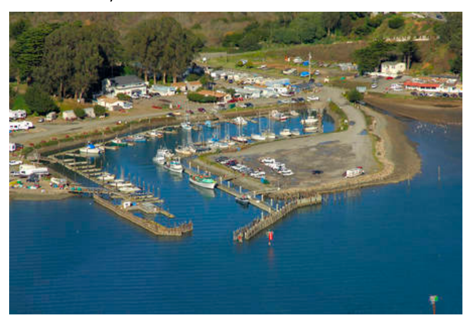
Porto Bodega Marina & RV Park

Permanent inundation of all or a portion of marinas would result in the loss of marine industrial land area to bay waters.