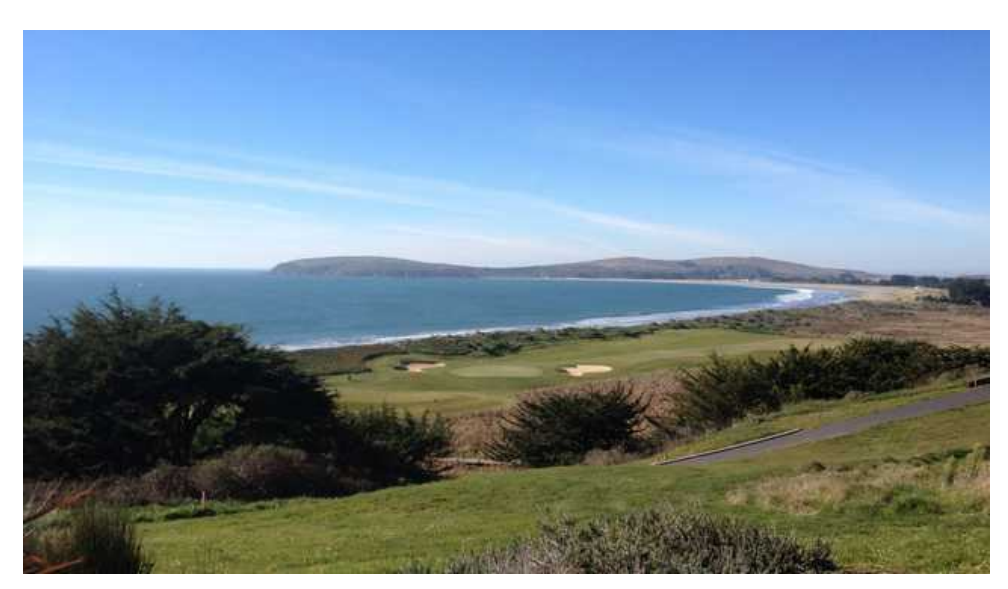
Links at Bodega Harbour Golf Course

In 2030 the grounds would not be permanently inundated by sea level rise, and 6% of the grounds would be subject to periodic flooding during storm events. In 2100 under the best case scenario 9% of the grounds would be permanently inundated and 21% would be subject to periodic flooding during storm events. Under the worst case scenario, 23% of the grounds would be permanently inundated and 40% would be subject to periodic flooding.