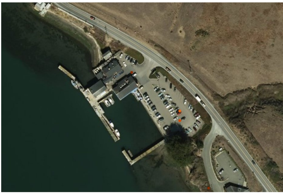
Lucas Wharf Restaurant & Bar

COM-1. In 2030 5% of the area would be permanently inundated by sea level rise and 9% would be subject to periodic flooding during storm events. In 2100 under the best case scenario, 10% of the area would be permanently inundated and 14% would be subject to periodic flooding during storm events. Under the worst case scenario, 9% of the area would be permanently inundated and 19% would be subject to periodic flooding.