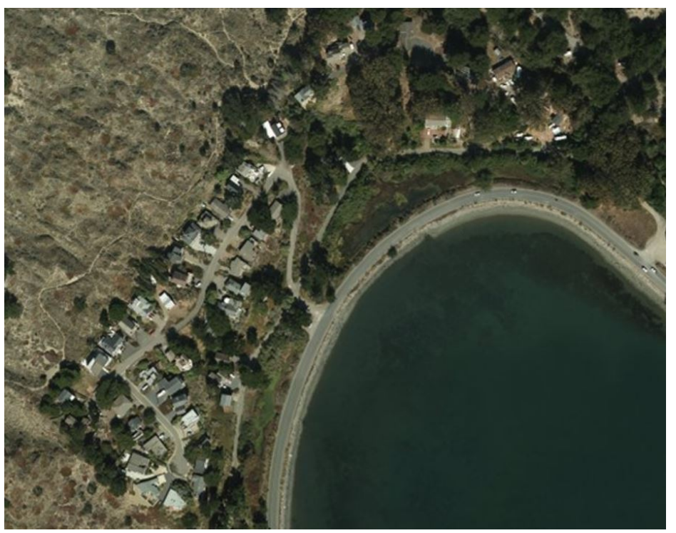
UR-2 and RR-1