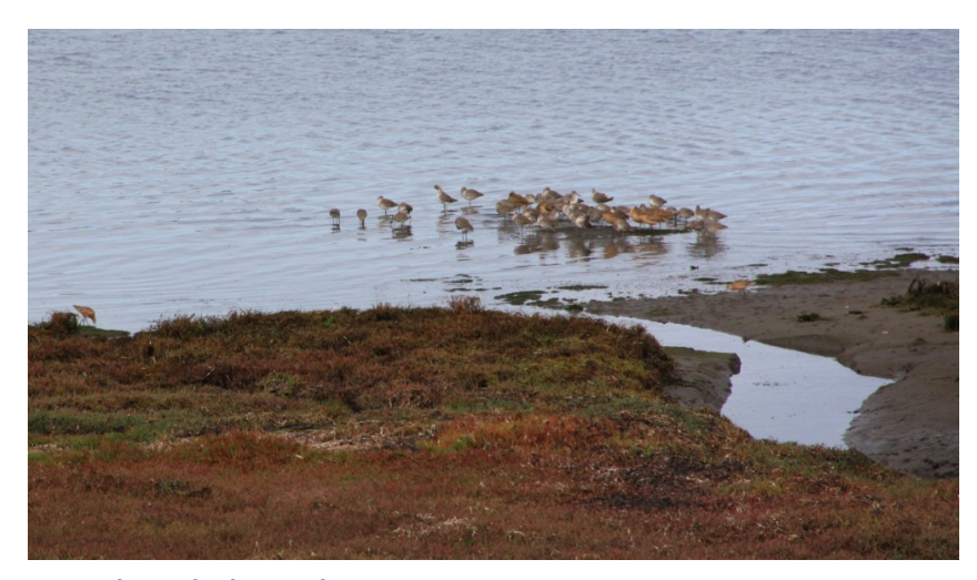
Coastal Brackish Marsh

Data on the location and size of coastal wetlands is from the San Francisco Estuary Institute and Aquatic Science Center, part of the California Aquatic Resource Inventory (CARI; Inventory). The Inventory is a compilation of wetlands, streams, and riparian areas in California. This statewide dataset pulls together many sources of wetland data. In the case of Sonoma County, the National Wetlands Inventory, originally from the U.S. Fish and Wildlife Service, is the source of the wetland data. The National Wetlands Inventory was last updated in 2010 and was acquired by the San Francisco Estuary Institute in 2011. Table 3 identifies the California Aquatic Resource Inventory wetland classifications comprising the Coastal Freshwater Marsh, Coastal Brackish Marsh, and Bodega Harbor Tidal Mudflat wetland categories.