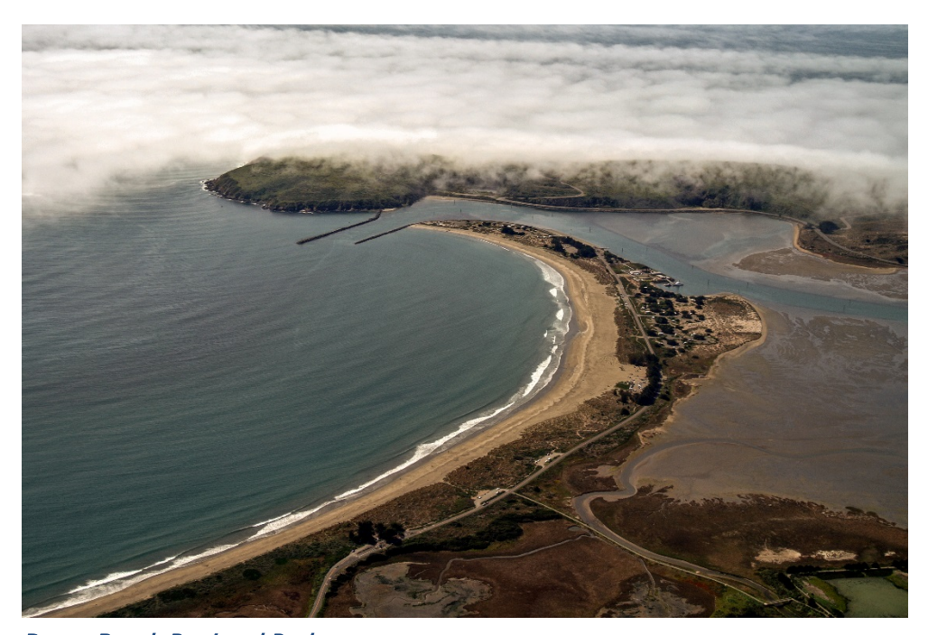
Doran Beach Regional Park

Doran Beach Regional Park. Doran Beach Regional Park has a wide, 2-mile stretch of beach on Bodega Bay and is ideal for walking, picnicking, playing in the sand, flying kites, surfing, and bird-watching. Over 120 tent and RV campsites are available. A boat launch provides access to Bodega Harbor for sport fishing, kayaking, stand-up paddling, and kite surfing. A jetty at the harbor mouth is a popular spot for rock fishing and exploring sea life.