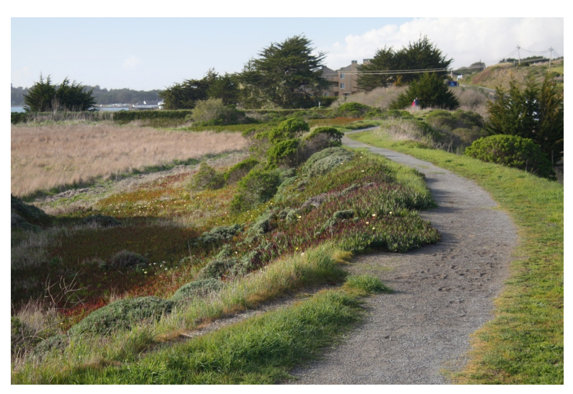
Birdwalk Loop Trail

The Dredge Spoil Disposal Ponds Site is projected to be at risk of permanent inundation from sea level rise by 2100. In 2030 less than 1% of the site would be permanently inundated by sea level rise and 2% would be subject to periodic flooding during storm events. In 2100 under the best case scenario, 2% of the area would be permanently inundated and 3% would be subject to periodic flooding during storm events. Under the worst case scenario, 2% of the area would be permanently inundated and 5% would be subject to periodic flooding.