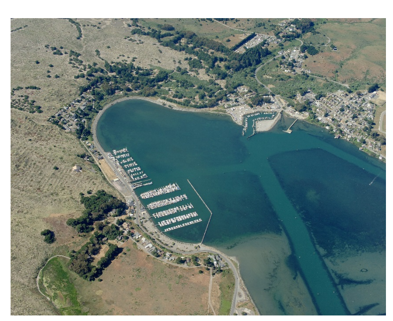
Bodega Harbor Area

Assets in the Bodega Harbor Area vulnerable to sea level rise and storm events include Westshore, Eastshore, and Bay Flat Roads; public and private marinas; residential development; and coastal freshwater marsh and tidal mudflat. Sea level rise will impact these valuable assets leading to potential impacts on access; land use; habitats, including critical habitat; recreation and tourism; and commercial fishing. The floating docks at some of the marinas are resilient to rising tides; however, the residential development and the low-cost visitor-serving facilities at marinas are not as adaptable. Some residential buildings may not have direct impacts from sea level rise due to their elevation, but could become isolated and cut-off from all services due to compromised access and damaged utilities.