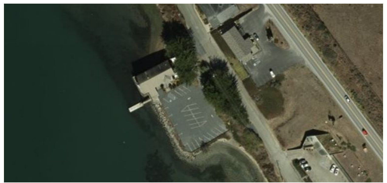
Bodega Harbour Yacht Club

The Bodega Harbour Yacht Club is projected to be at risk of permanent inundation from sea level rise by 2100. In 2030 8% of the site would be permanently inundated by sea level rise and 34% would be subject to periodic flooding during storm events. In 2100 under the best case scenario, 13% of the site would be permanently inundated and 49% would be subject to periodic flooding during storm events. Under the worst case scenario, 48% of the site would be permanently inundated and 60% would be subject to periodic flooding.