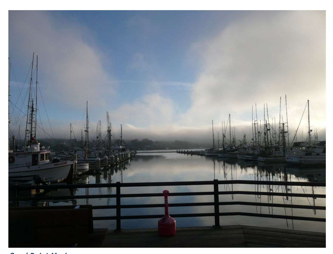
Spud Point Marina

Annual festivals demonstrate the economic and cultural significance of fishing to the Bodega Bay community: the Fisherman's Festival and Blessing of the Fleet for the approaching salmon season in April and The Seafood, Art, Music, and Wine Festival in August.