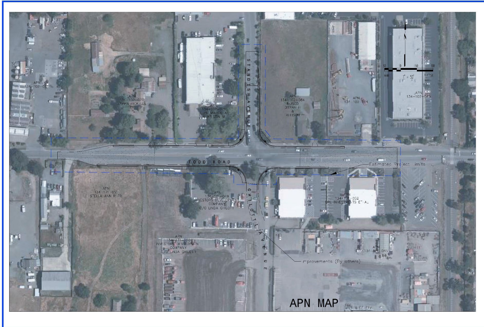
Figure 2 Project Limits and Conceptual Design