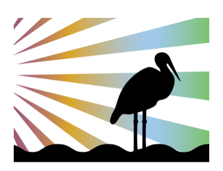
Local Coastal Program Permit Sonoma

2550 Ventura Avenue Santa Rosa, CA 95403