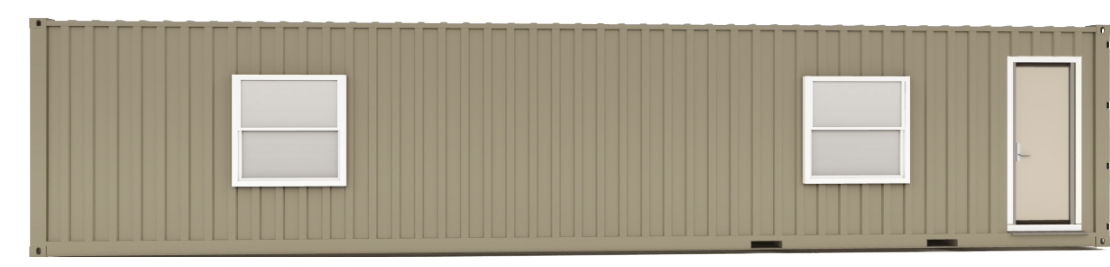
O & M BUILDING