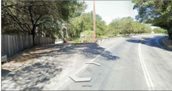
EXISTING ACCESS STREET VIEW